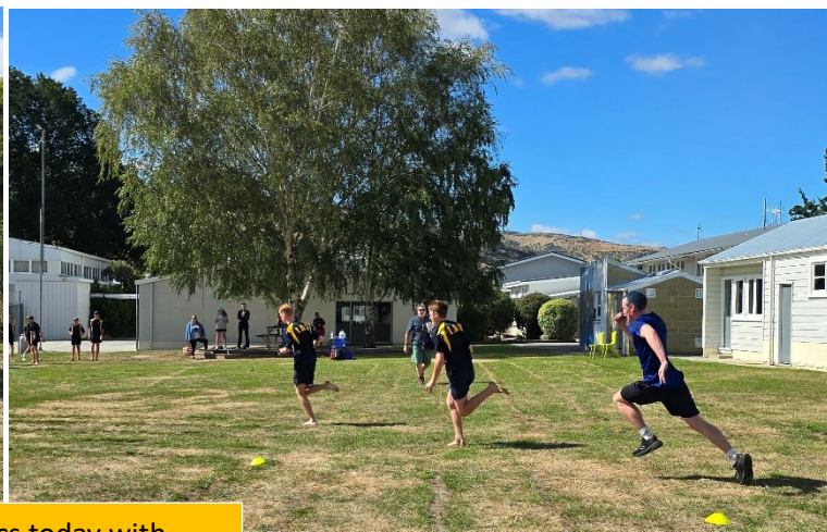
Senior Athletics today with Lawrence Area School