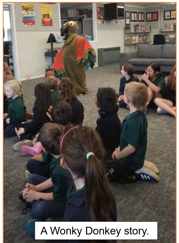
A Wonky Donkey story.

The Year 5 and 6 classes have been continuing their learning about rockets, exploring how they move in space and how they function. In maths, they've been focusing on column addition, and in literacy, they've been working with PHOM to help strengthen their reading and writing skills. The Year 7 and 8 class have been using protractors to draw and measure angles in geometry. In English, they've been learning how to write thriller stories, developing their narrative skills. As part of their science work, students have been working in groups to design and carry out experiments related to natural disasters. During P.E., all junior students have also been participating in Māori games using poi.