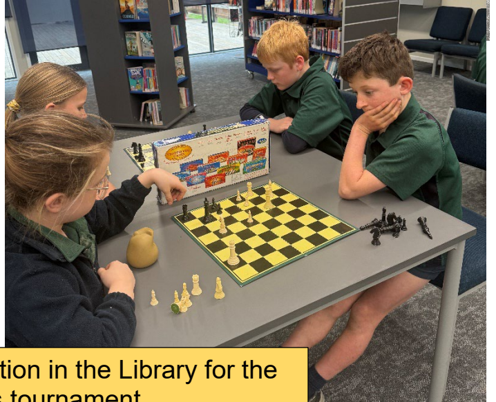
Some looks of concentration in the Library for the annual Chess tournament.